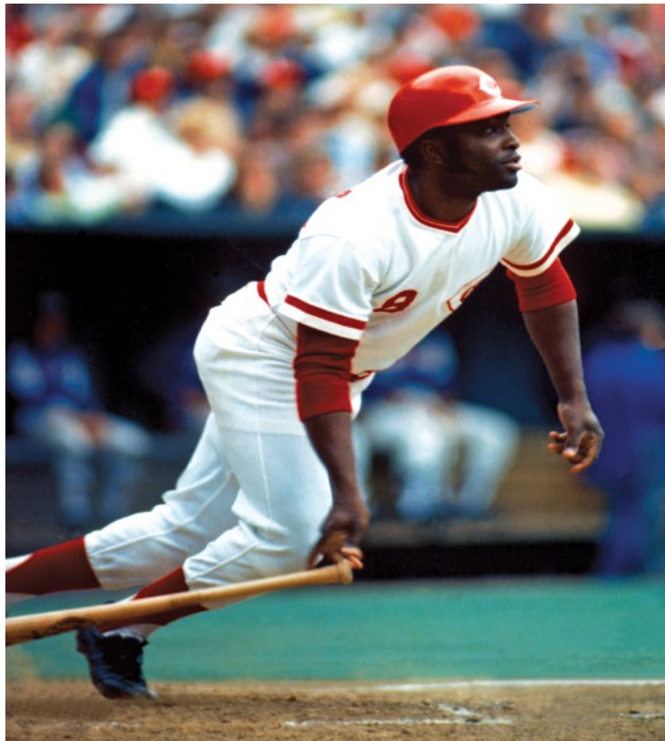
Left: Morgan as an ESPN commentator. Right: Morgan playing for the Cincinnati Reds.