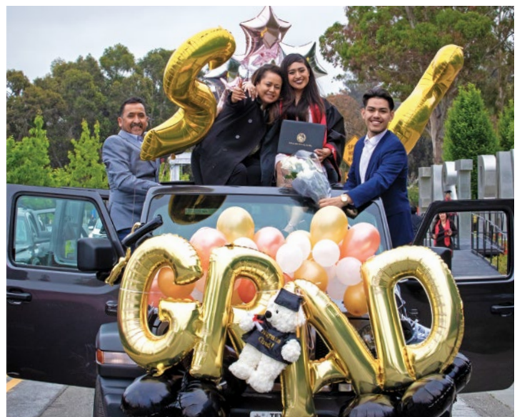
Cal State East Bay celebrated the accomplishments of its 2020 and 2021 graduating classes.

"Earning a degree from Cal State East Bay is life-changing for our students and their entire families," she said. "While we would have loved to honor them with our traditional in-person event ... it was just not yet safe to have a large event in Pioneer Stadium. Our creative solution of a Car-mencement ceremony was so well-received by our graduates and we enjoyed celebrating their achievements in this unique way."