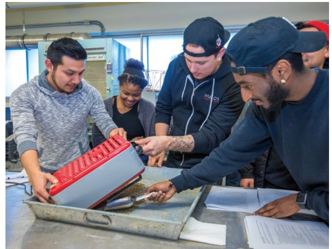
Cal State East Bay Construction Management students work on a project during class.

programs where most of our members work, CEA has built strong partnerships with academic institutions as well as help prepare students for dynamic careers and leadership in the industry."