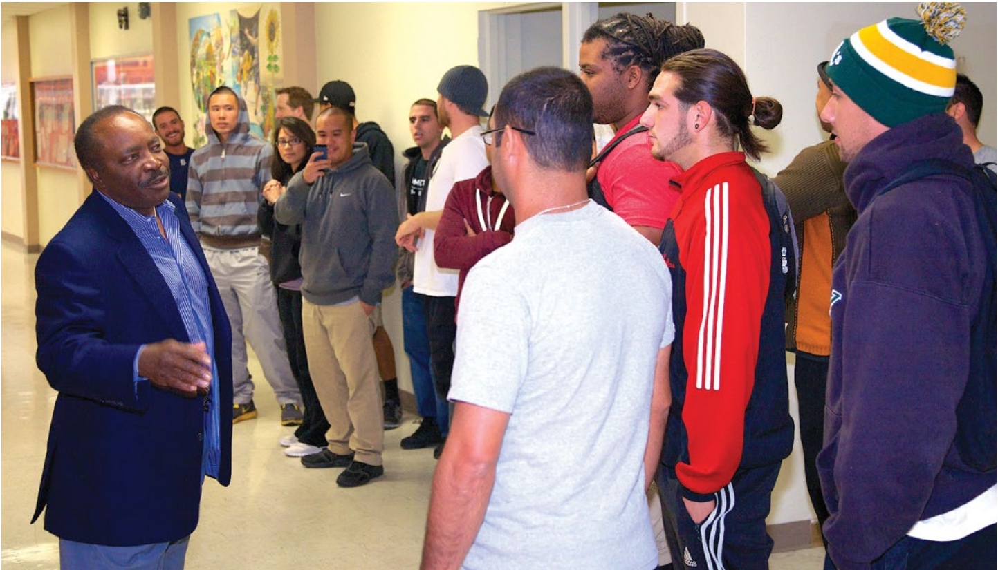
Morgan converses with Cal State East Bay students.